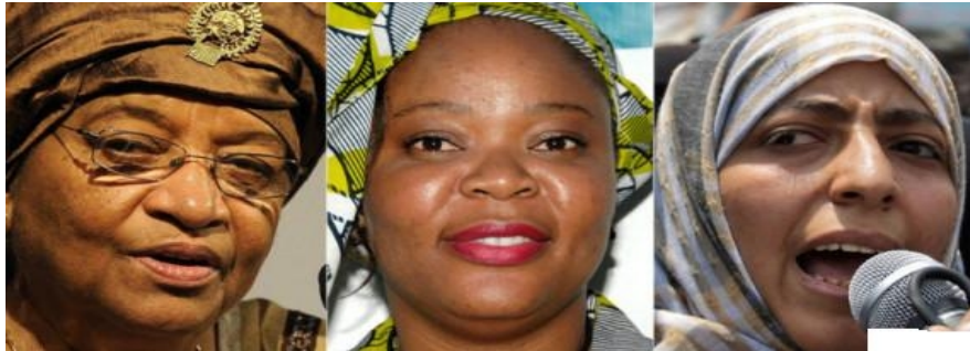
Ellen Johnson-Sirleaf :: Leymah Gbowee :: Tawakkul Karman