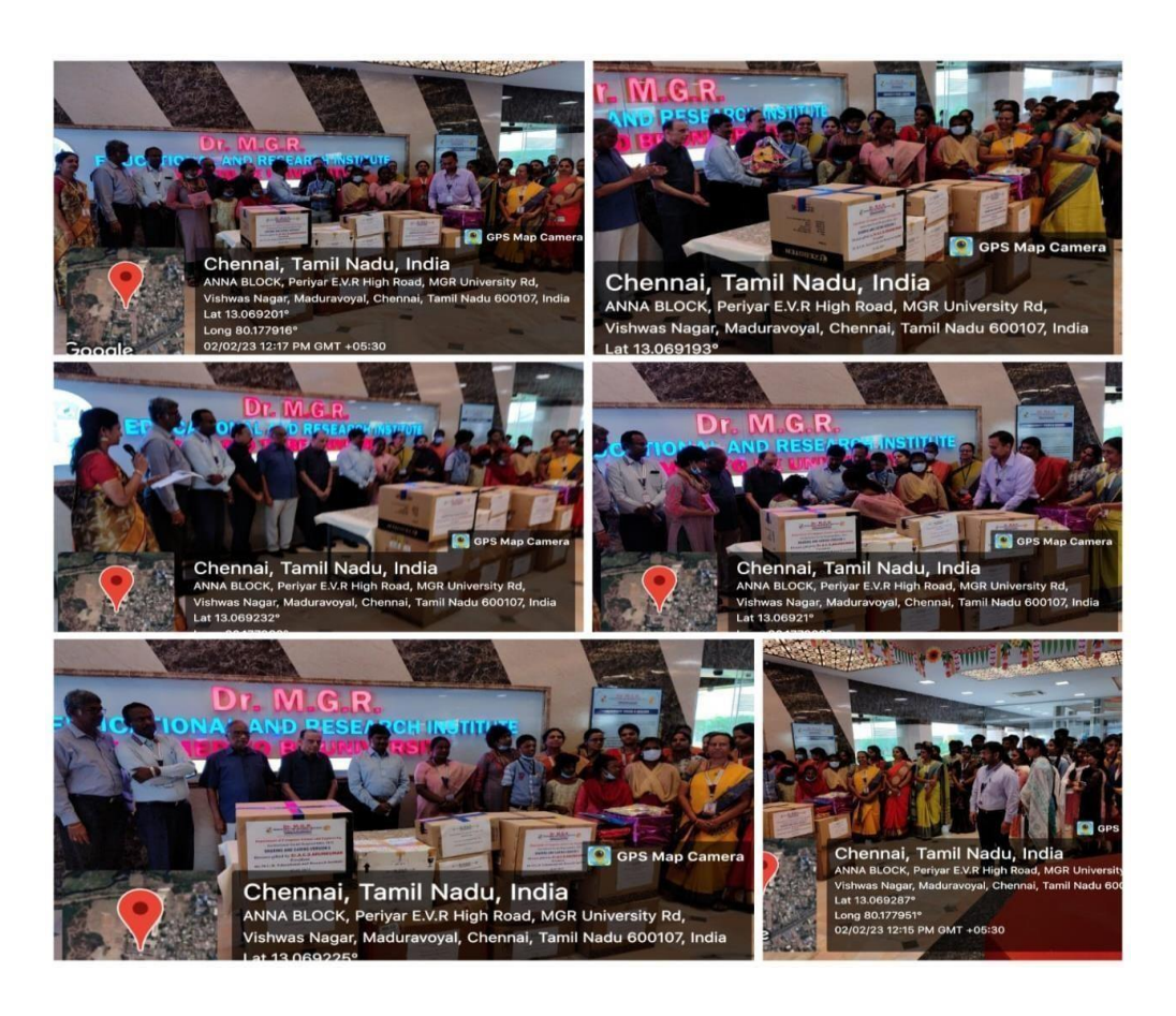
FIG 1 PRESIDENT DISTRUBUTES TO A VOLUNTEER OF CAN STOP CHENNAI