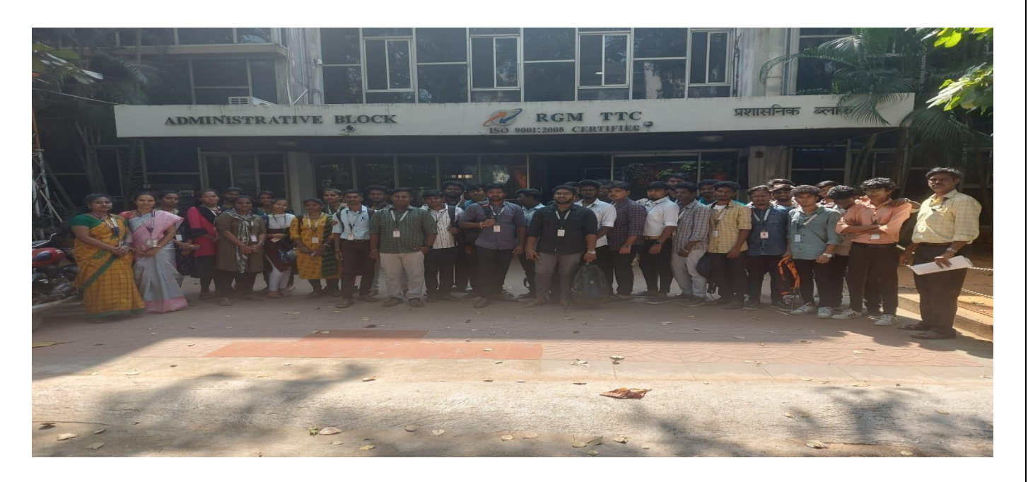
FIG 2 DAY 2 VISIT