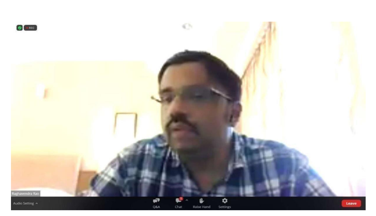
Fig.1 Speaker giving the technical talk on AI and ML