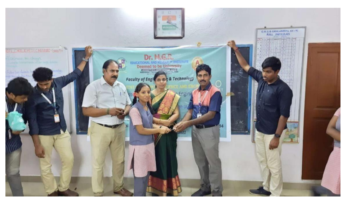
Fig 1: prize distribution for all winners