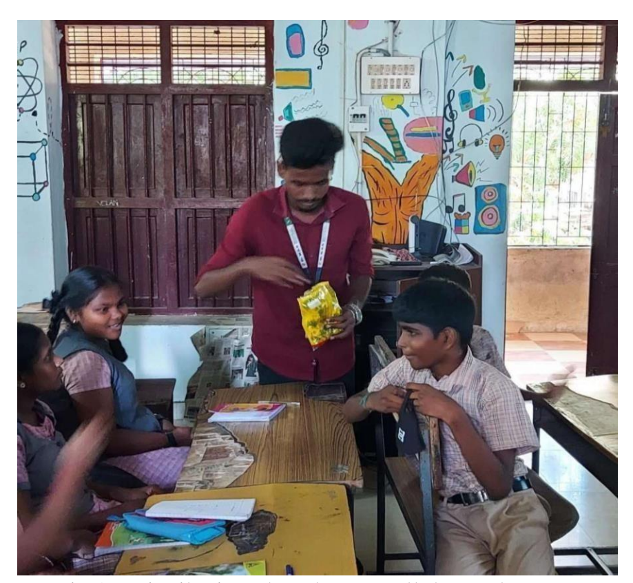
Fig 2: Distributing chocolates to all the students