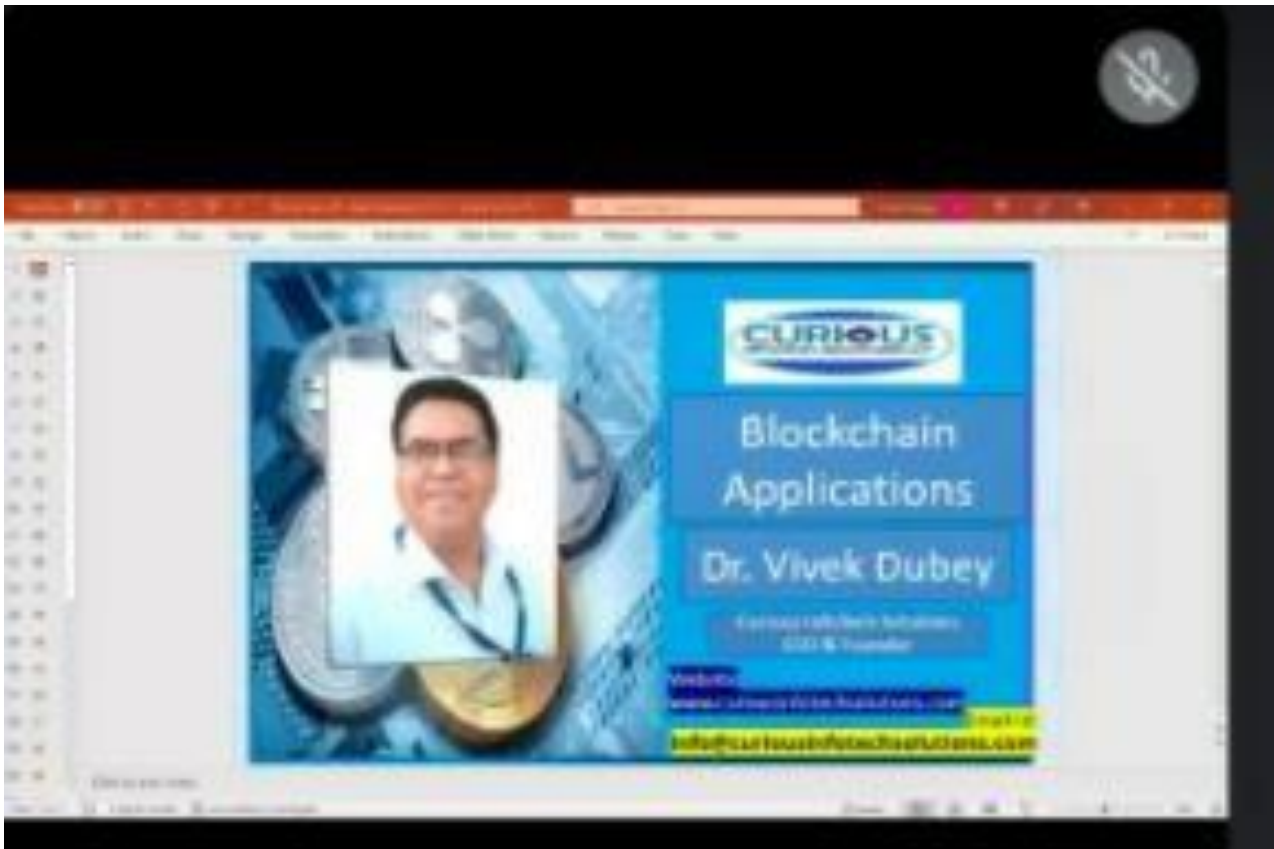
Figure 2: Association conveners and students attending the session.