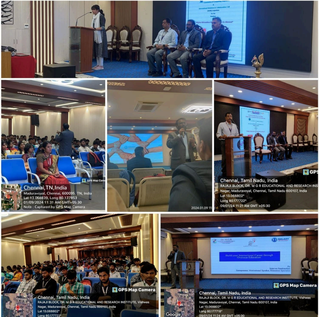
Fig 5: A Glimpse of the Event