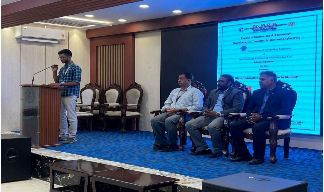
Fig 3: The event was hosted by Mr. Vignesh III-year Student