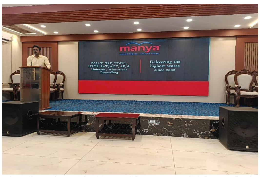
Fig 3: The Speaker explained the potential ways to accomplish future studies through various competitive exams in India as well as abroad.