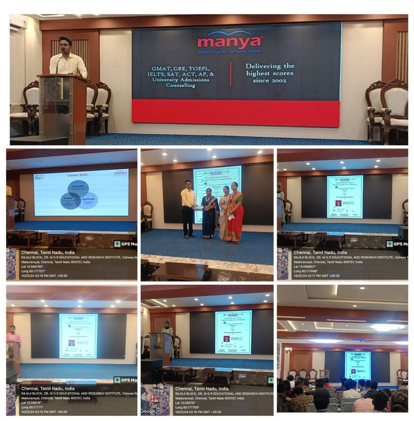
Fig 5: A Glimpse of the Event