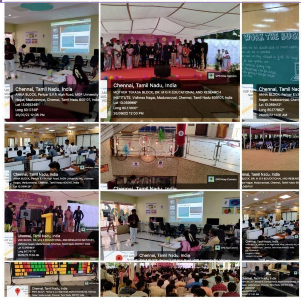
Fig.2 Techastra 22 Activities