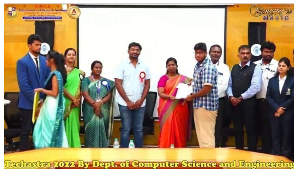
Fig.3 Techastra 22 Valedictory