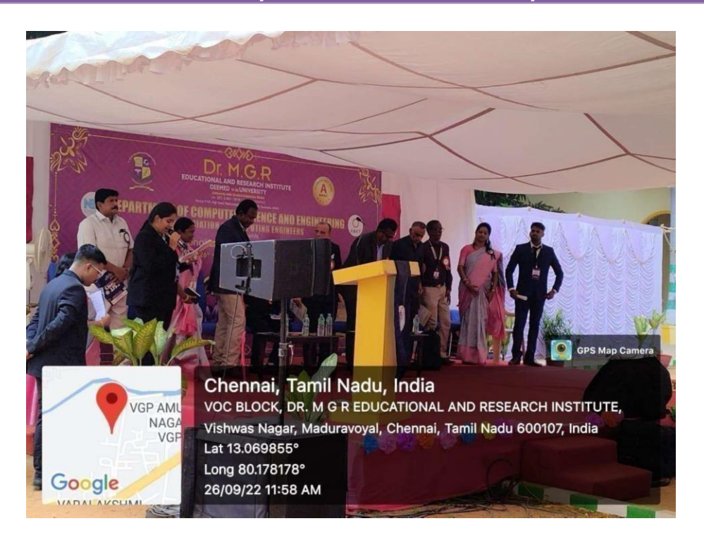
Fig. 1 Techastra 22 Inaugural