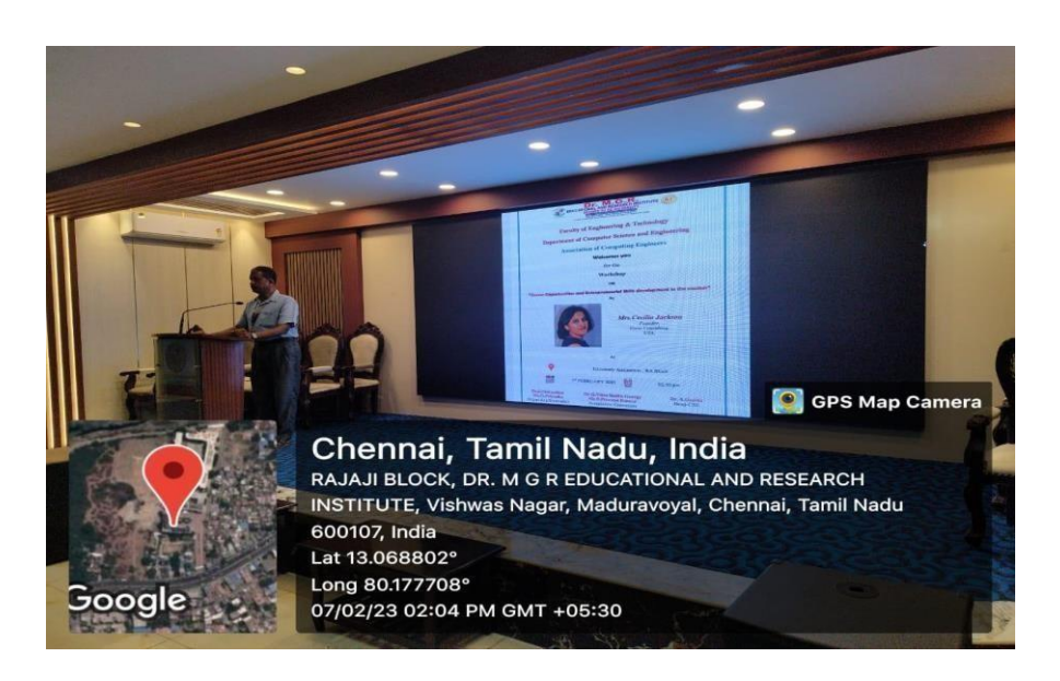
FIG 1 ADDITIONAL HOD ADDRESSED THE GATHERING