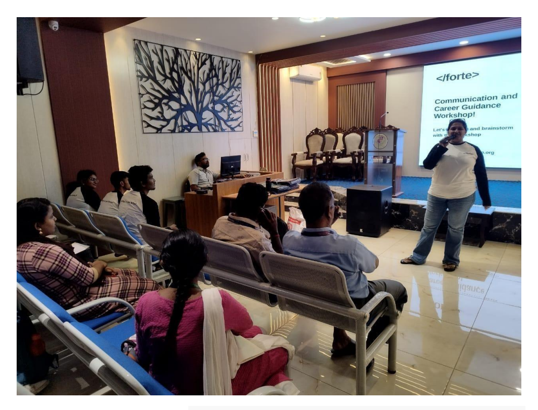
FIG 2 SPEAKER GIVEN INTRODUCTION ABOUT THE SOFT SKILLS REQUIRED FOR JOB INTERVIEWS