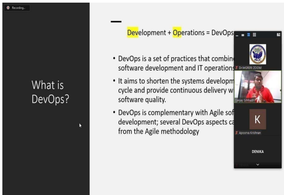
Fig3: speaker presentation on azure fundamentals