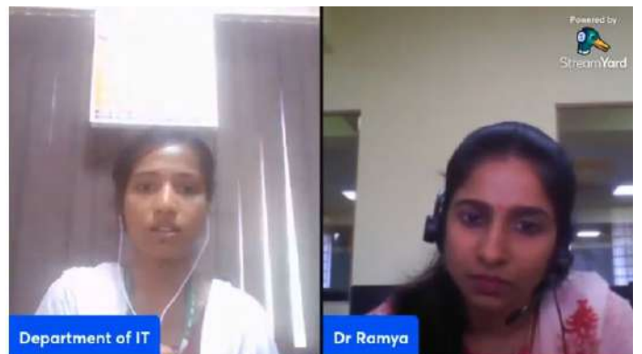
"Breast Feeding Awareness Program- Enabling Breastfeeding, Making a Difference for Working Parents"