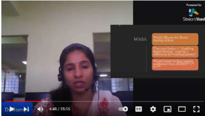
"Breast Feeding Awareness Program- Enabling Breastfeeding, Making a Difference for Working Parents"