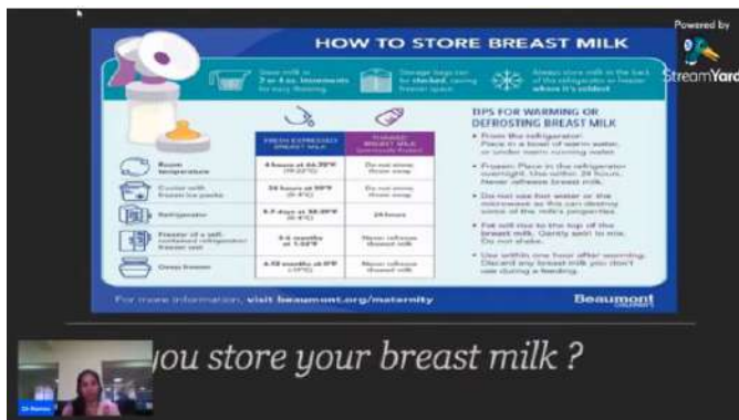
"Breast Feeding Awareness Program- Enabling Breastfeeding, Making a Difference for Working Parents"