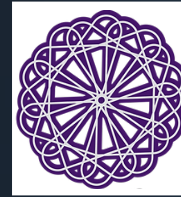
Quanta Calculus Pvt Ltd, India