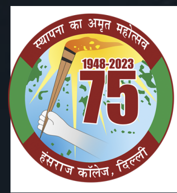
Hansraj College (University of Delhi)