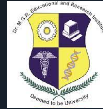
Dr. M.G.R Educational & Research Institute