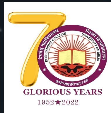
Deshbandhu College (University of Delhi)