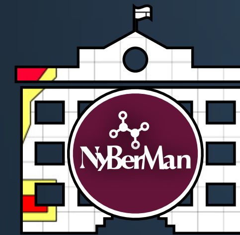
NyBerMan Bioinformatics Orleans, France