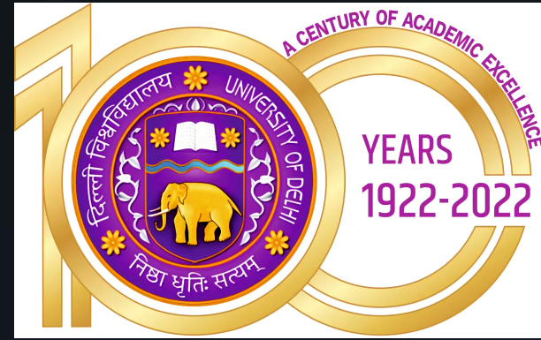
Institute of Eminence (University of Delhi)